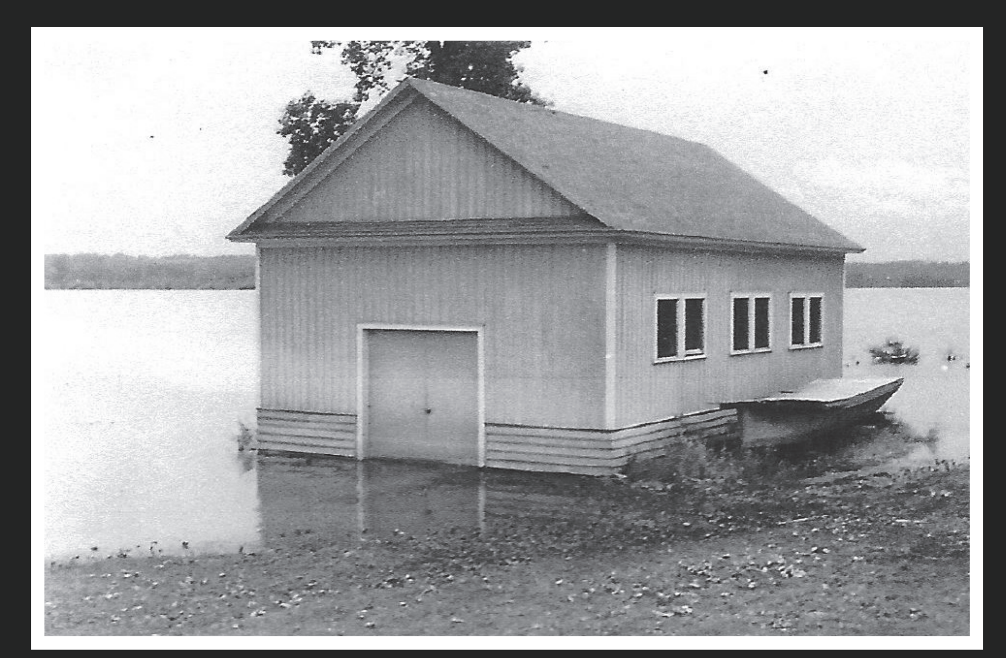
Overview of Boathouse during high water in 1941, facing southwest.